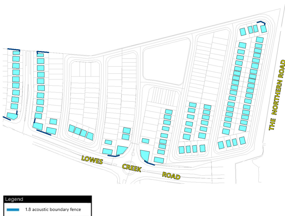
Figure 2: Boundary Fence Locations

An acoustically rated fence can be constructed of common building materials but needs to be from a durable material with sufficient mass (min. 10 kg/m 2 ) to prevent direct noise transmission e.g. colorbond masonry, fibrous-cement, lapped and capped timber fence, polycarbonate, or any combination of such materials, provided they withstand the weather elements. A natural barrier of trees or shrubs is not an effective noise screen. The boundary fence should be continuous with no gaps between panels or underneath panels (other than that required for gates). It is recommended that rebates be incorporated into any gates.