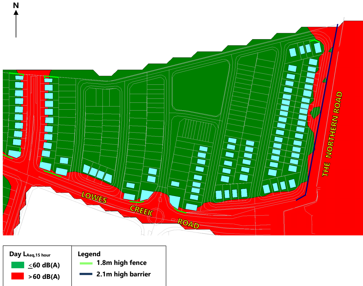
Figure 3 – Design Year 2031 Day Time L_{Aeq,15\text{ hour}} Noise Contours (Ground Floor)