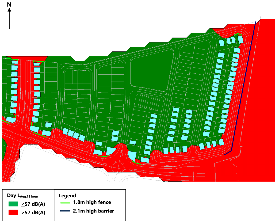
Figure 7 – Design Year 2031 Day Time L_{Aeq,15\text{ hour}} Noise Contours (Camden Council Open Space Criteria)